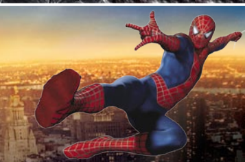
Main: Tobey debuts his slinky black number From left to right: The alien symbiote latches onto Spider-Man; Tobey with co-star Kirsten Dunst; Spidey in action