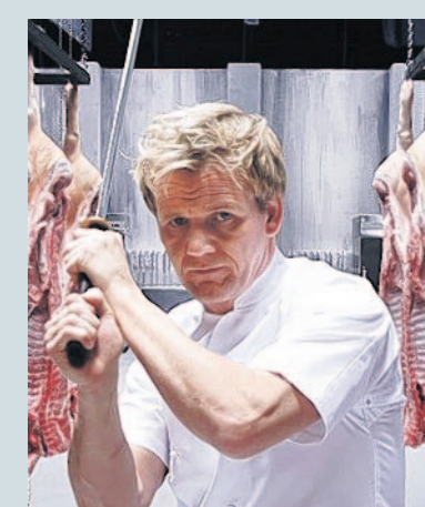
Gordon Ramsay's F Word is among the shows available for download

Or, for a frankly more entertaining time, follow the odds on the Labour leadership race at