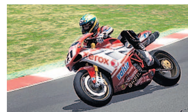
SBK-08 Superbike World Championship PS2, PC, Xbox 360; £20-£40. Age 3+ ★★★★★

The Soul Calibur series is among the classiest of beat-'em-up games. Your character must fight all-comers in one-on-one battles to win a legendary sword. This instalment brings the biggest mixture of combatants yet, featuring samurai swordsmen, warrior women and even Star Wars characters. The graphics are superb, with settings ranging from pirate ships to the hangar of an Imperial Star Destroyer, and the action is non-stop. What a belter. Stuart Andrews